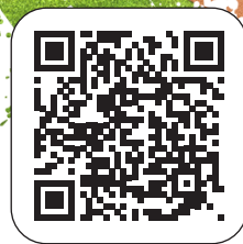
53757 | Scrap and Stack