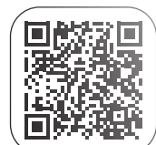
52861 | Share Cart