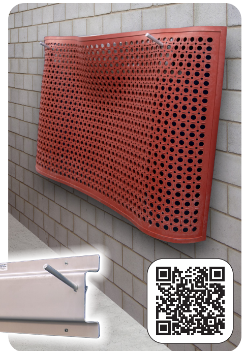
52677 | Wall Mount Mat Rack