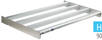
H.D Bar Shelf 900 lbs. capacity