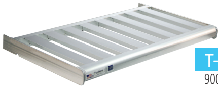
T- Bar Shelf 900 lbs. capacity