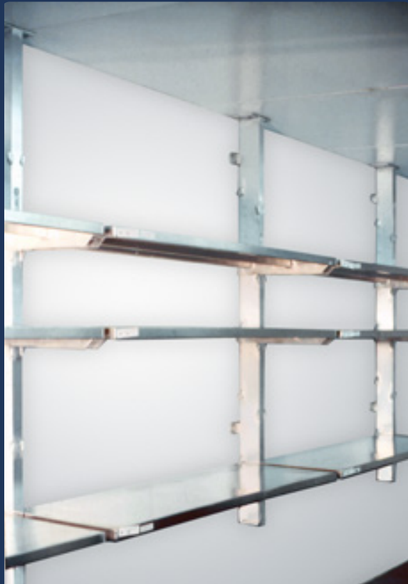
Ceiling Mounted Unit