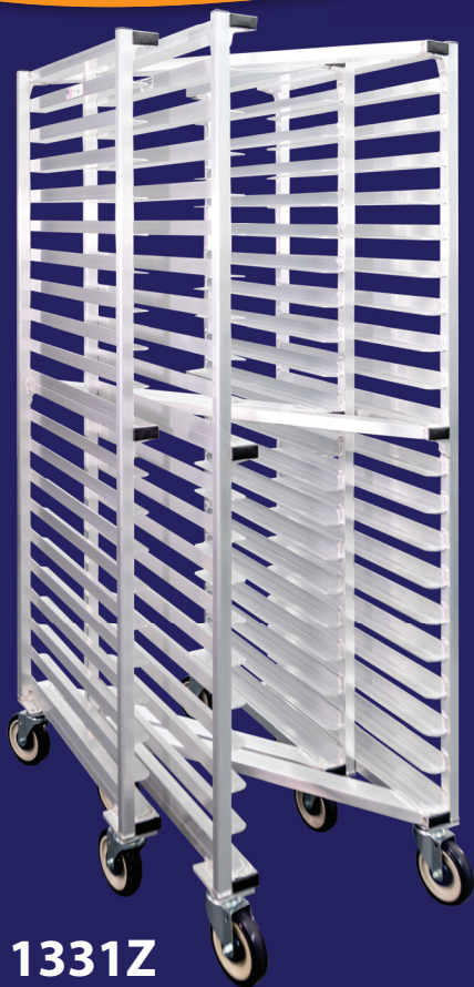
1331Z Full Size