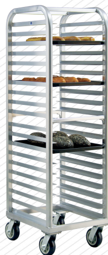
4331 | Bun Pan Rack Lifetime Series