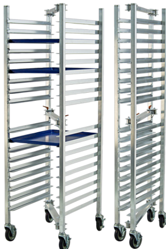
98678 | Folding Bun Pan Rack