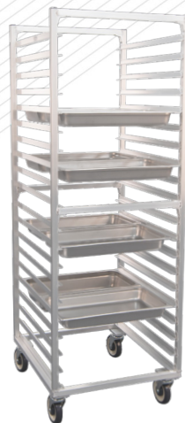
1509 | Steamtable Pan Rack Holds 12" x 20" Pans