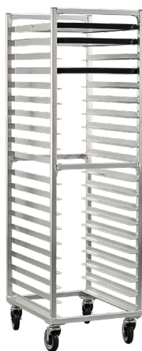
1331 | Bun Pan Rack Heavy Duty