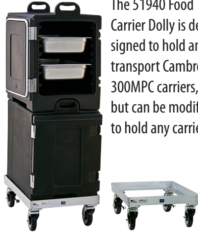
51949 | Food Carrier Dolly

Ideal for catering and banquet transport and storage, these dollies help prevent injury and save time.