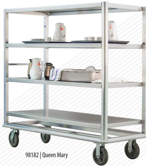
98182 | Queen Mary