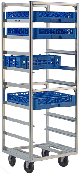
97142 | Glass Rack

Ideal for transporting and storing cups and glassware from the service area to the back room. This cart eliminates the stacking and re-stacking of baskets by allowing quick, easy access to all dish baskets simultaneously.