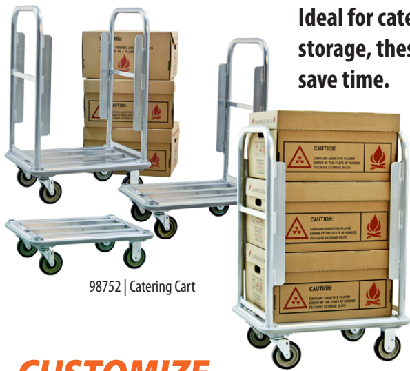
98752 | Catering Cart

Ideal for catering and banquet transport and storage, these dollies help prevent injury and save time.