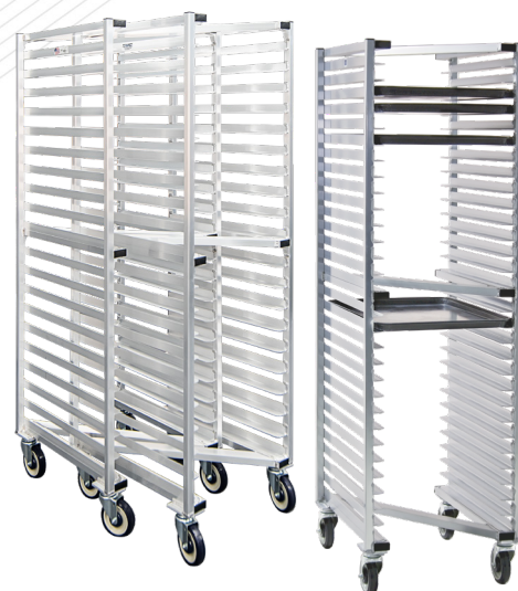
1331Z | Nesting Pan Rack "Z" Type Holds 18" x 26, 13" x 18" and 14" x 18" pans