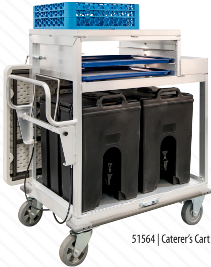
51564 | Caterer's Cart

Organize product and make more space for storage in back rooms or coolers.