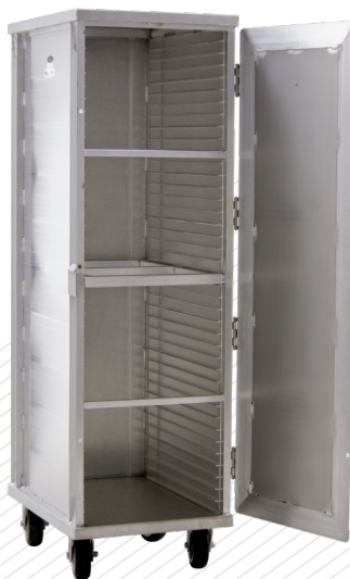
1290PP | Enclosed Cabinet