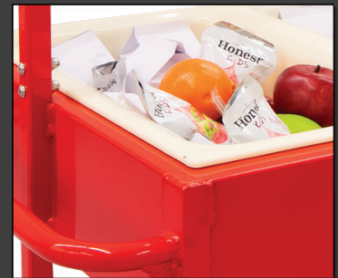
INCLUDES HACCP compliant cold food pans.