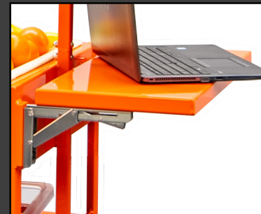
OPTIONAL Solid Shelf (#52919ORANGE)