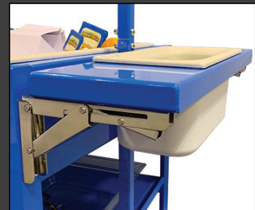
OPTIONAL Cold Pan Shelf (#52918BLUE)